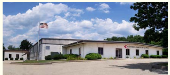
Corporate Office - 23,000 sq/ft manufacturing facility.